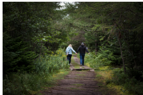
Walk in The Woods - Pretty Special