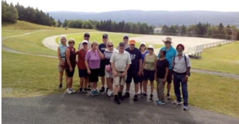
Cowan Heights Neighbourhood - Stop at the Ball Park