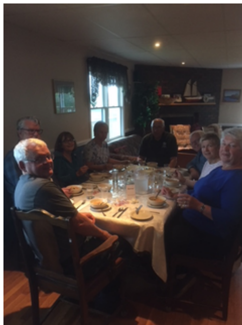
Enjoying the Pea Soup and Fresh Bread