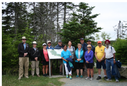
Gull Pond Adventure!