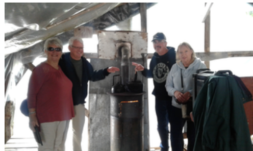
Nothing Better Than a Wood Stove!