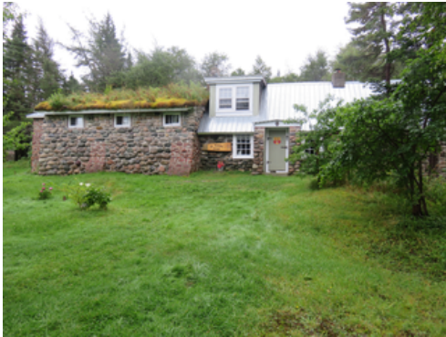
The Rock House