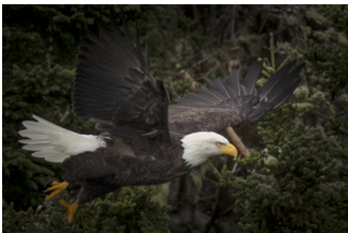
The Bald Eagle Takes Flight!