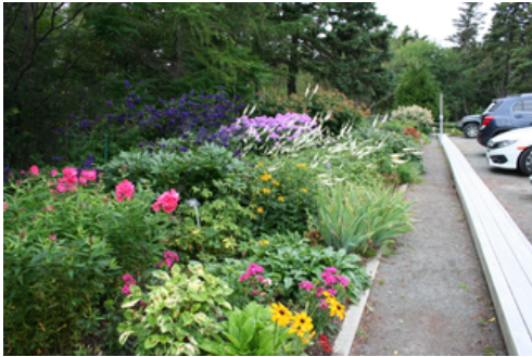
MUN Botanical Gardens - This Was Just the Parking Lot!