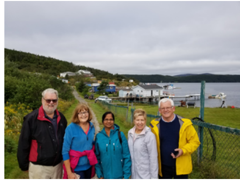
Out For a Stroll