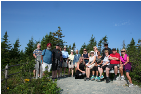
One of the Many Trails in the Botanical Garden