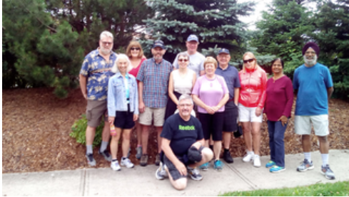
Ready to Explore Downtown St. John's