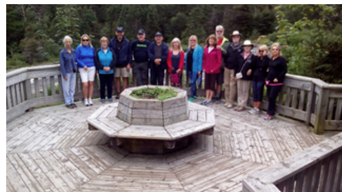
Manuel's River - Always a Beautiful Walk