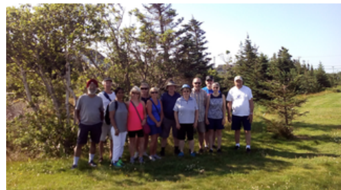
Octagon Pond - Here We Go!