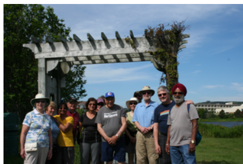
Kenny's Pond and Kent's Pond Walk - What a Great Way to Start!