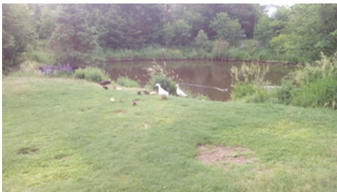
Duck Pond in Cowan Heights - See the Little Ducklings?