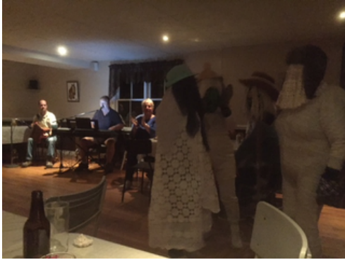
Mummers Arrive - Let the Fun Begin!