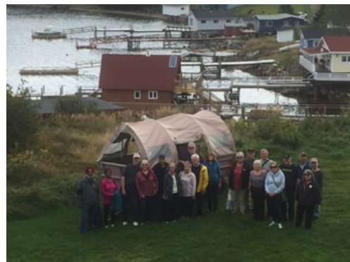
Group Picture at Woody Island