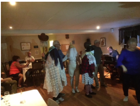
Everyone Up and Dancing!