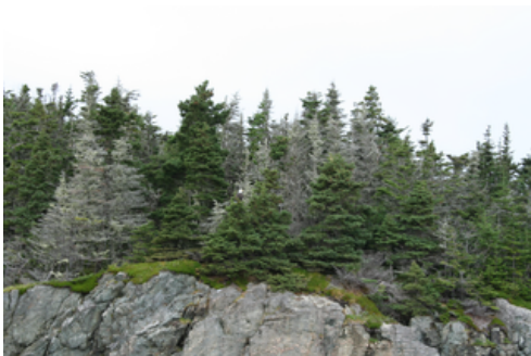
Can You Spot the Bald Eagle?