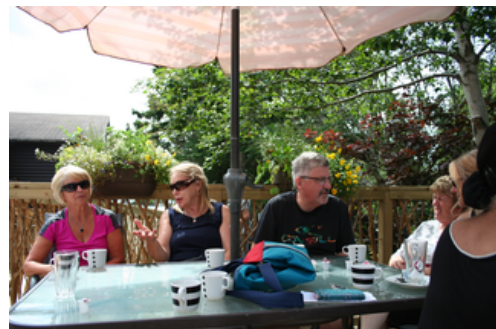
Enjoying a Coffee at the Garden Cafe