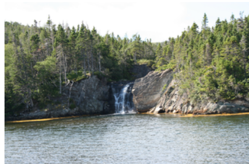
Waterfall on Way Back to Garden Cove