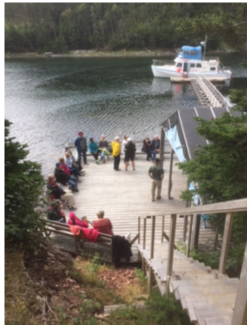
Relaxing at Muddy Hole