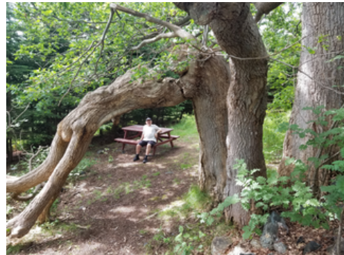
Aubrey Enjoys the Shade Under a Tree!