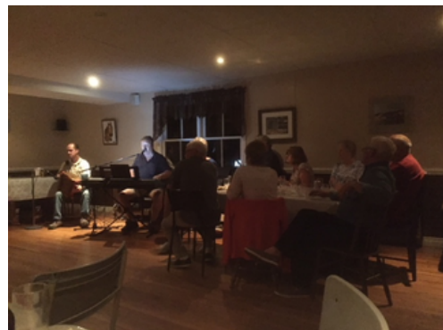
The Music Plays On!