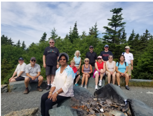
Mount Scio Summit - A Well Deserved Break