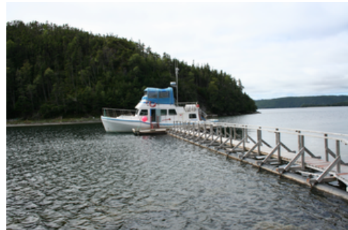
Moored at Muddy Hole