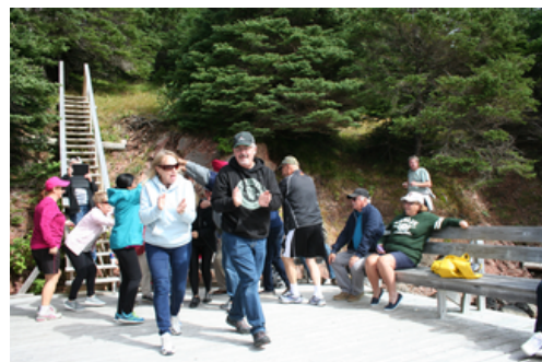
Virginia Reel - So Much Fun!