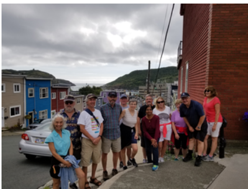
Top of Chapel Street with Narrows in the Background