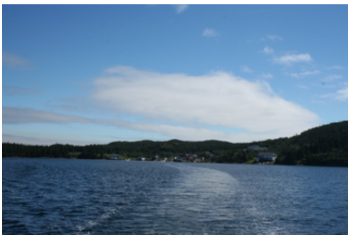
Good-bye Woody Island - Till Next Time