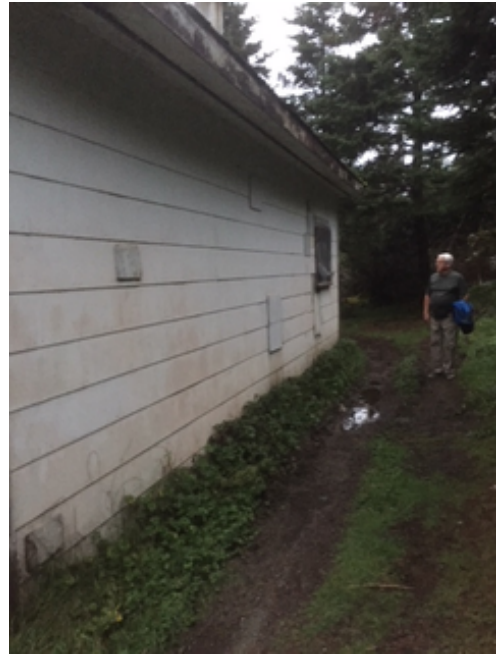
Roy Checks Out the Old Diesel Generator Building