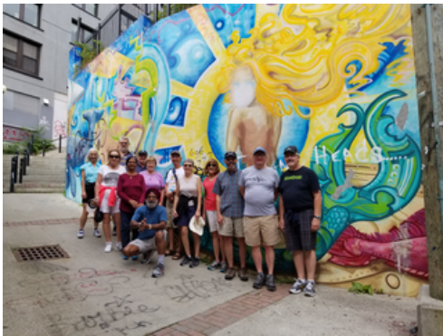
Soloman's Lane's Mural