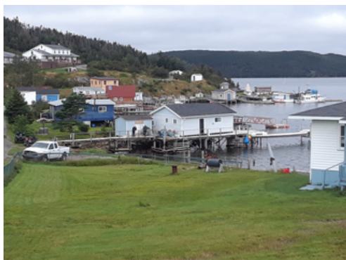
Beautiful Woody Island