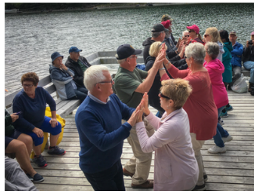
The Virginia Reel Gets Going Again!