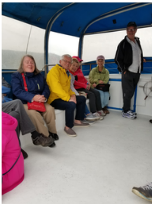
Smiles All Around