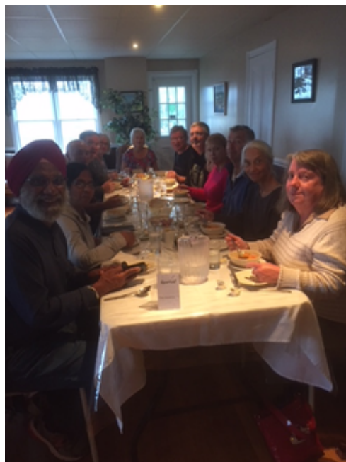
Good to the Last Drop!