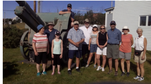
Outside the Legion in Pleasantville