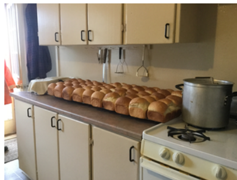
Home-made Bread - Yummy!