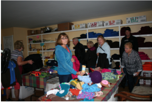
Shopping at the Woody Island Mall!