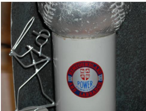
Mystery Artifact - View 2