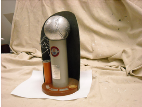
Mystery Artifact - View 1